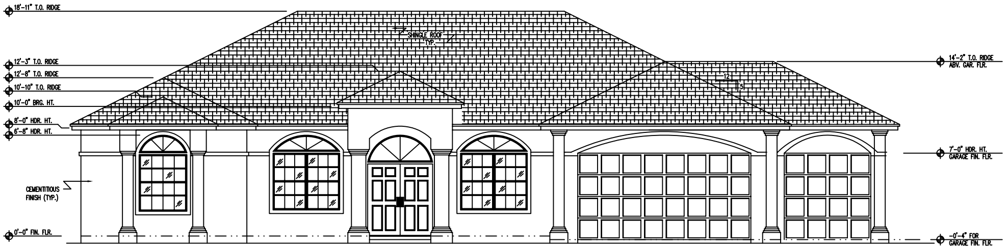
1 FRONT ELEVATION 1/4" = 1'-0"